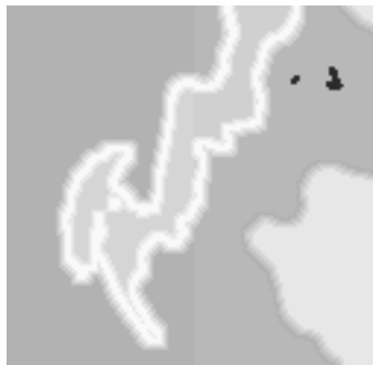
Figure 1: Fuzzy soil map presents imprecision along the soil polygon boundaries.

The construction of a fuzzy model for managing imprecision of soil polygon boundaries was created and the expert knowledge was transformed into a rule base and the membership functions were produced. The membership functions of soil types were varied according to the soil types and the region where the area is located. The transitional zone was varied according to the soil types and the width was based on the expert opinions. The resulted map is shown in figure 1.